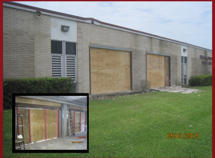
Demolished openings for O. H Coiling doors on the North side.