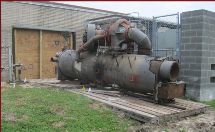
Removed existing equipment.