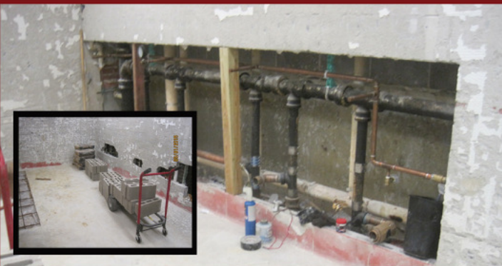
Installed plumbing for new fixtures.