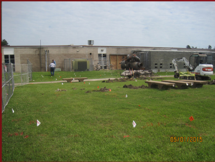
Located existing utilities and formed slab for new chillers.