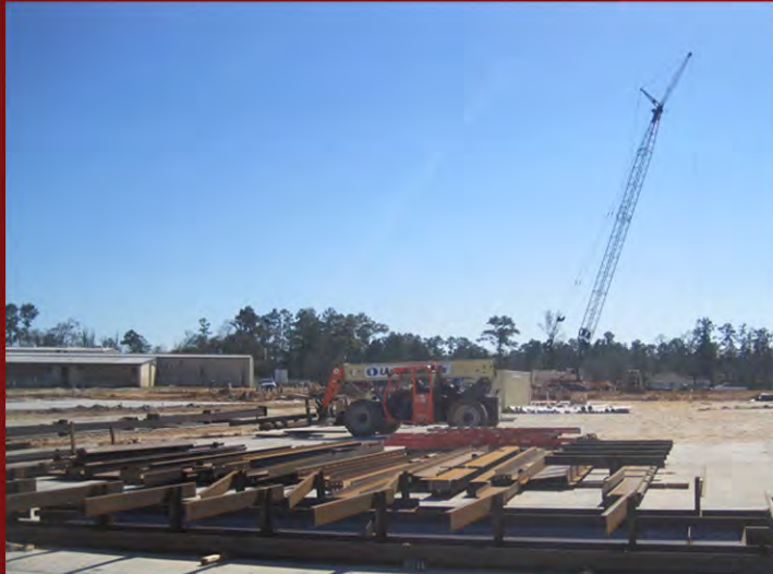
Area A steel and grade beam reinforcement awaiting installation.