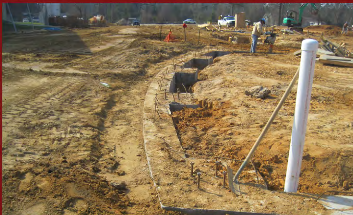
Installing underslab plumbing and grade beams.