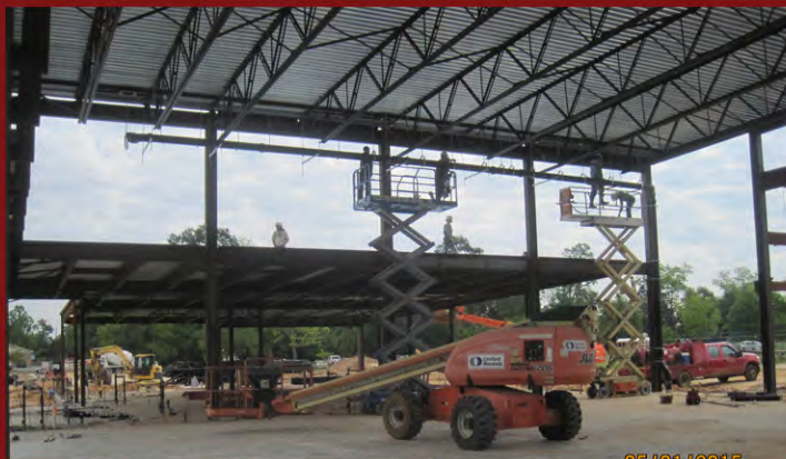
Continued receiving and erecting steel structure and roof drain piping.