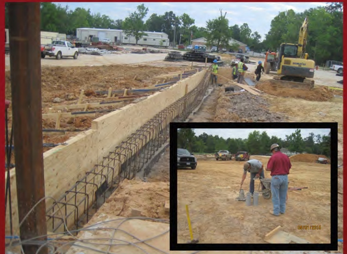
Forming grade beam at food service area.