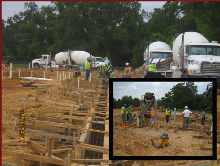
Installing grade beam at classroom area.